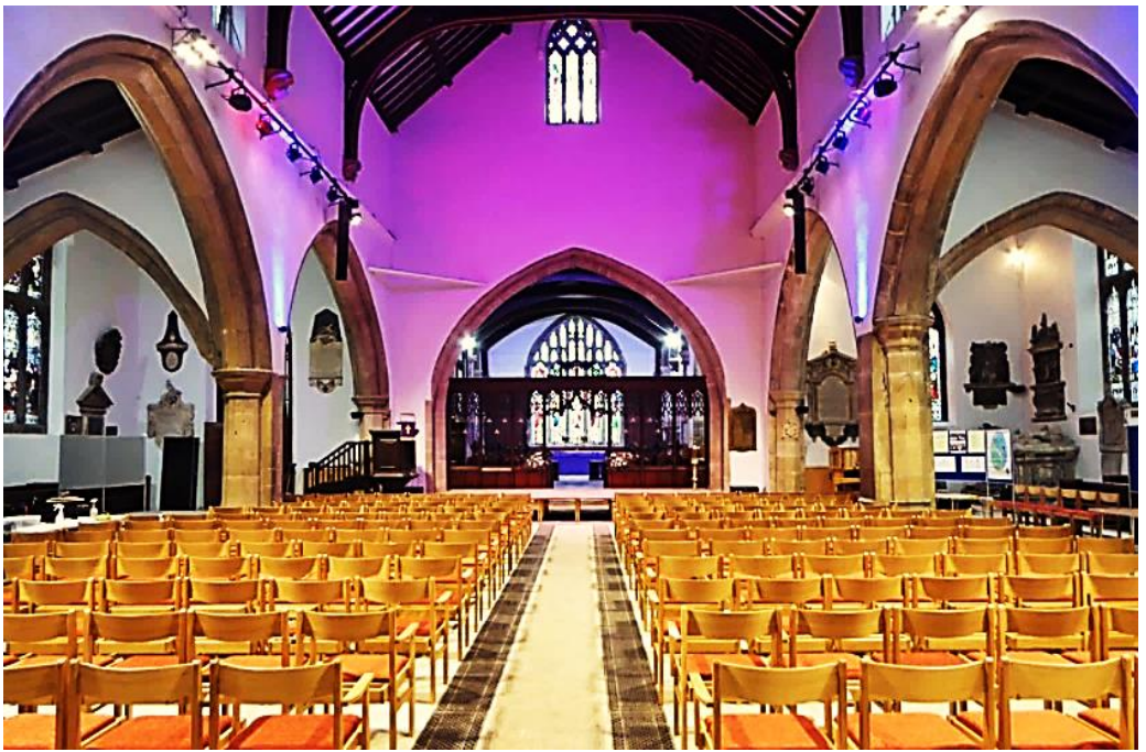
Otley Parish Church